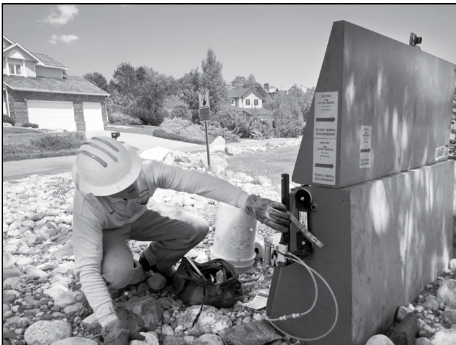
PVREA lineman Heath Smith checks the pressure on an underground power line during treatment of cables in Taft Canyon. The process is less expensive than replacing the aging conductor with new wire.

If you find your name in this month's issue call 970-282-6422 to collect your prize.